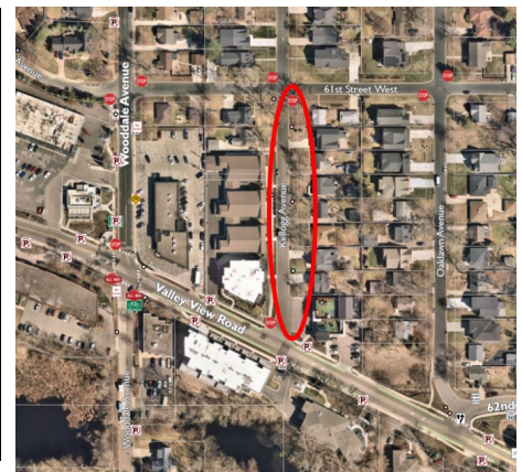
6100 block of Kellogg Ave

Staff recommends maintaining one-hour parking restrictions on east side of Kellogg Ave between 61 st St and Valley View Rd.