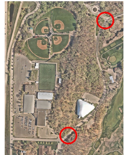
Requested Crosswalks in Braemar Park

Staff recommends installing a marked crosswalk with roadside signs at the southern crossing (~820' east of McCauley Trl), with further study on whether this crossing warrants an RRFB. Staff recommends further study of a marked crosswalk at the northern crossing, with potential implementation as part of the future Hilary Ln reconstruction project.