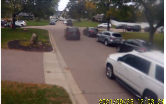
Beard PI facing north towards W 62 nd St

Staff recommends implementing parking restrictions on the west side of Beard PI north of 62 nd St and on the south side of 62 nd St between the existing parking bays near Strachauer Park.