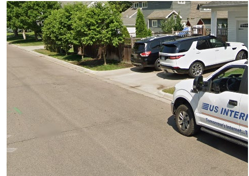
Boulevard trees obstructing parking restriction sign

Staff recommends drafting an ordinance amendment to allow the City to trim or remove vegetation that is obstructing traffic control devices.