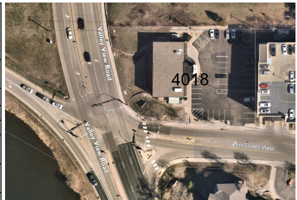
W 65 th St at Valley View Rd & HWY 62 eastbound exit

Staff recommends no action based on crash history and existing traffic operations.