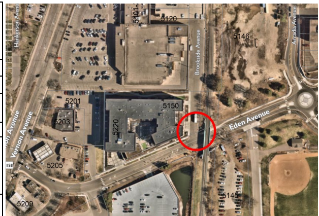
Brookside Ave at Eden Ave