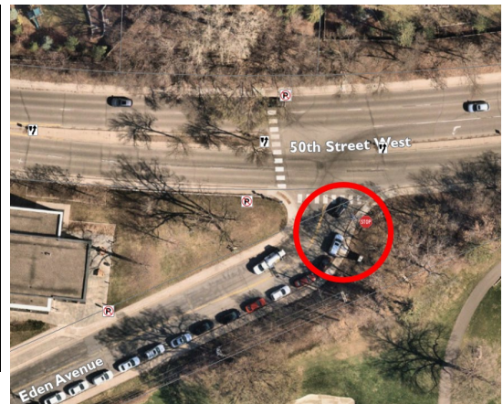
Eden Ave at W 50 th St

Staff recommends restricting parking along the curve of Eden.