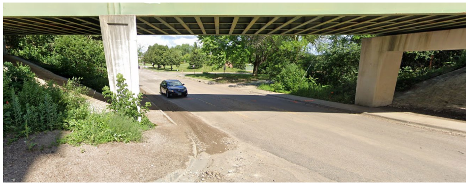
Brookside sight line facing east

Staff recommends no action. Railroad bridge pier is the main obstruction and is not scheduled for improvements in the near future.