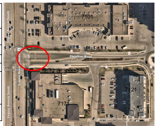
Hazelton Road at France Avenue

Staff recommends no action citing volume of U-turns and crash history.