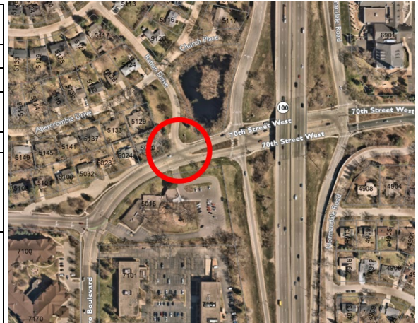
W 70 th Street at Rabun Drive

Staff recommends no action as stop controls along W 70 th St would significantly impact the level of service at the two adjacent intersections.