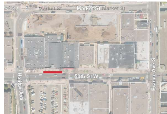
50 th & France

Staff recommends signing 10-minute parking in the bus pullout to accommodate loading/unloading, curbside pickups, and other pick-up/drop-off uses.