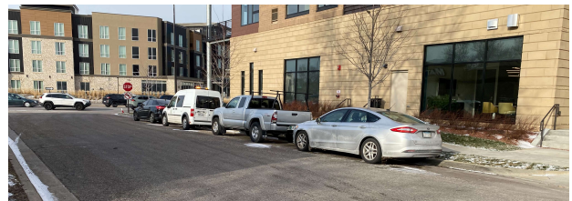
Southdale Circle adjacent to Aria, facing west

Staff recommends adding signage designating a loading/unloading zone on Southdale Circle adjacent to Aria.