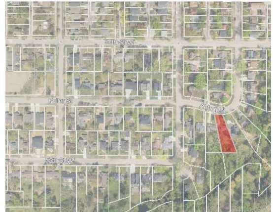
Creek Knoll Neighborhood

Staff recommends no action and informed the resident they can apply for a permit to widen the driveway apron.