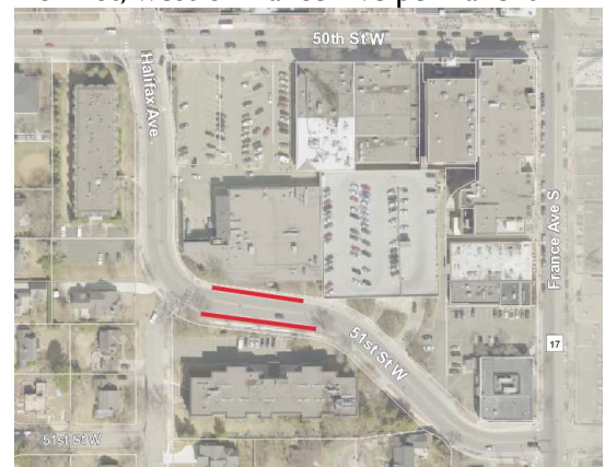
Map: Location of W 51 st St (note- area in red is location temporary on street parking is allowed)

After review, staff recommends making the on-street parking on both sides of W 51 st St permanent. Staff cites the width of the street allows parking on both sides and this can lower vehicle speeds when parking is utilized. With no reported crashes taking place since parking has been temporarily allowed, there is no increased safety concern.