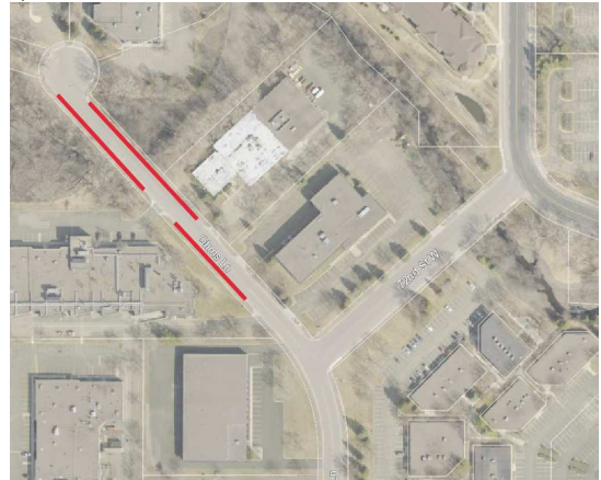
Map: Location of 7171 Ohms Ln (note- areas in red are where street parking restrictions are recommending removal)

After review, staff recommends removing on-street parking restrictions on Ohms Ln on both sides of the street, north of W 72 nd St. Parking will remain restricted on the north-east portion of Ohms Ln, from W 72 nd St to the driveway of 7125 Ohms Ln to allow adequate sight lines for the intersection and two properties north of Ohms Ln and W 72 nd St. Parking will remain restricted within the cul-de-sac at the northwest end of Ohms Ln.