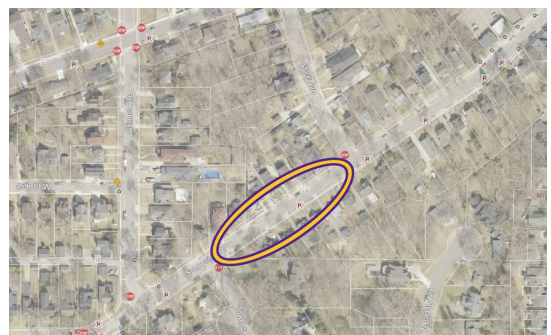
Map: Location of Sunnyside Rd, the area within the circle is where the resident is requesting the two-sided restriction