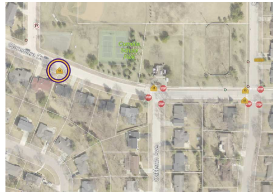
Map: Location of sign resident is requesting to move

After review, staff recommends removing the post with the two signs as eastbound drivers on Claremore Dr have adequate visibility for the stop sign at Oaklawn Ave. The school crossing sign will be replaced as a double-sided sign at the intersection of Claremore Dr/W 72 nd St and Oaklawn Ave. This should lead to raised awareness of pedestrian crossing at the intersection.