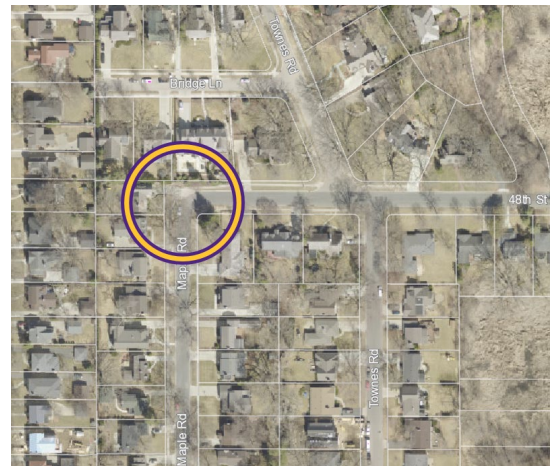
W 48 th Street and Maple Road

Left: Example of horizontal alignment sign with placard