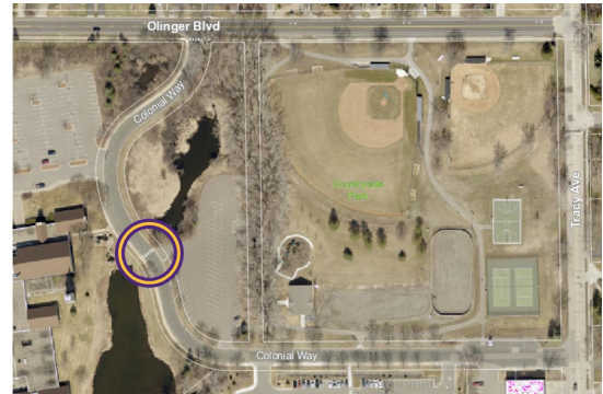
Map: Location of the marked crosswalk along Colonial Way

After review, staff recommends removing the on-street crosswalk markings. Staff agrees that since a crosswalk is not warranted, pavement markings may lead to a false sense of security to pedestrians. Staff also recommends installing a new pedestrian ramp on the sidewalk, adjacent to Colonial Church. Installing a pedestrian ramp will allow all pedestrians access to a sidewalk.