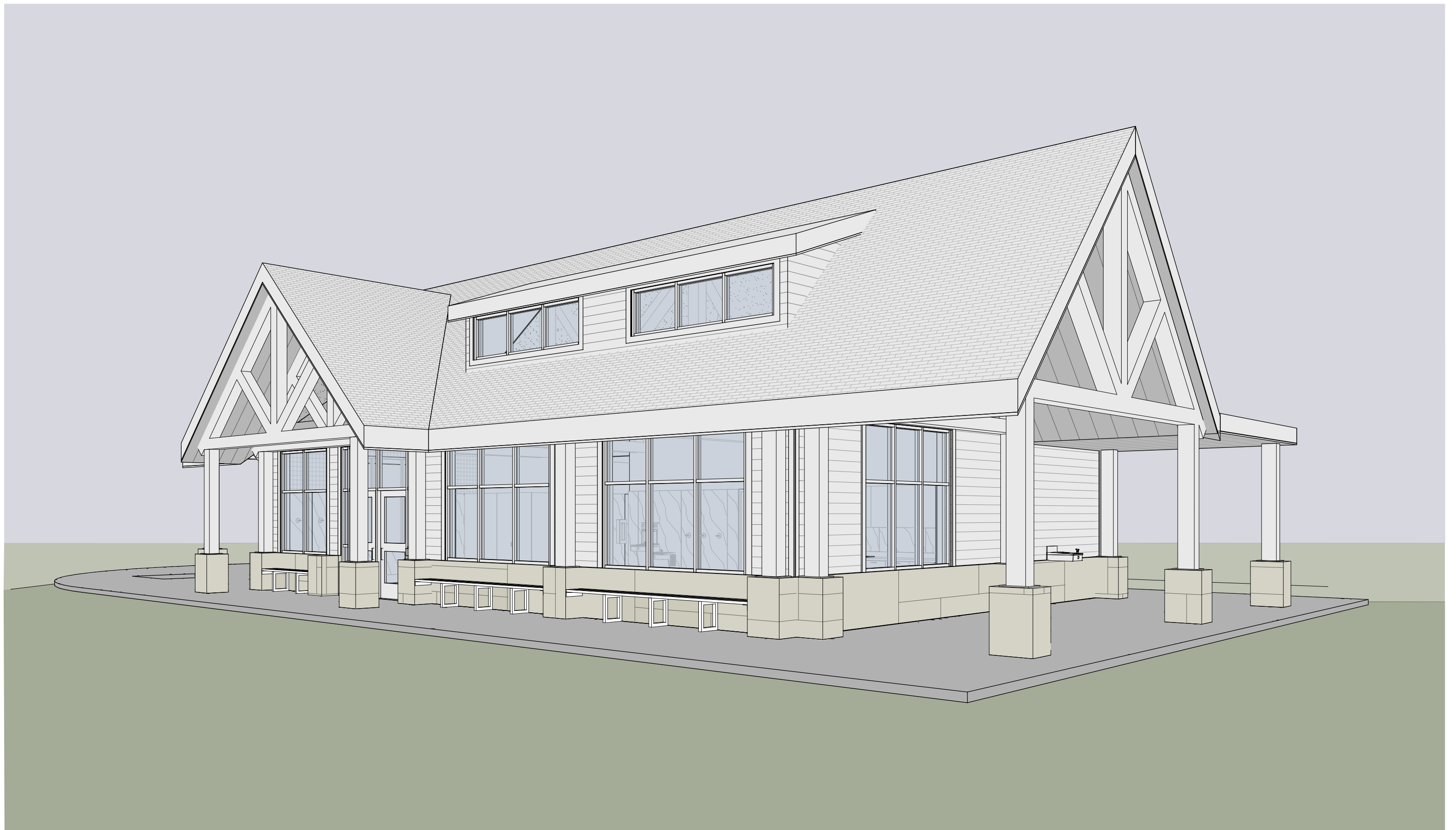
ARDEN PARK - NEW SHELTER BUILDING